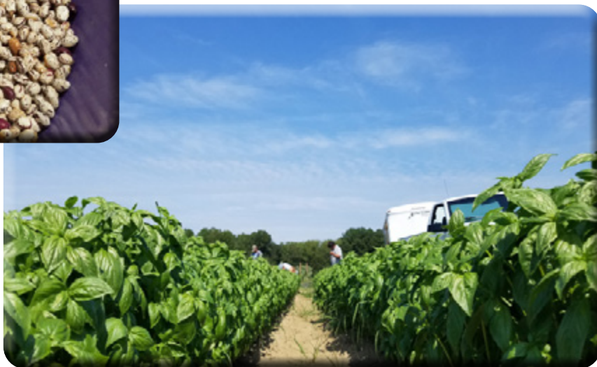
Above: This year Terp Farm produced 1600 pounds of Genovese basil (Prospera variety) that our culinary team converted to over 300 gallons of pesto, enough for an entire year of servings in the dining halls.

WUSA9 Story: The garbage they produce helps grow the veggies they eat