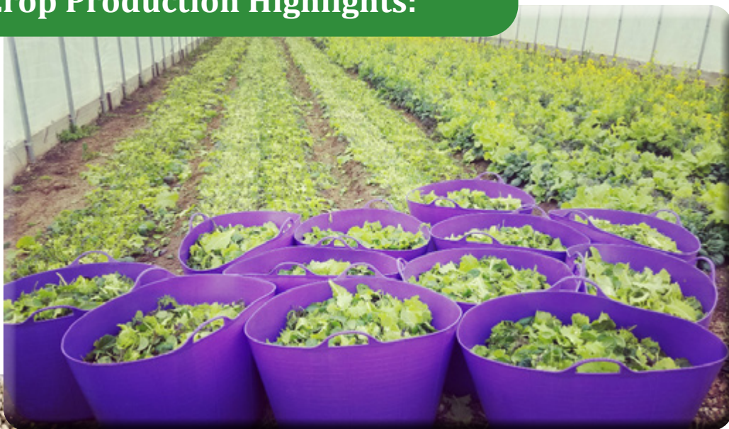
Above: Salad mix is a big part of our production in the Spring and Fall. In 2019 we harvested over 1000 pounds of our tried-and-true Premium Greens Mix, which consists of baby leaf varieties of Pac Choi, Tatsoi, Napa Cabbage, and Spicy Mustard.

Terps Vs Pros: Sustainable Food Challenge, Episode #4 Watch it!!