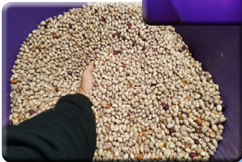
Above: Our catering chef requested we grow Tongue of Fire dry bean, an heirloom pinto variety that was first collected in the Tierra del Fuego region of South America.

WUSA9 Story: The garbage they produce helps grow the veggies they eat